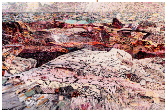
The Legacy of Armand Merizon