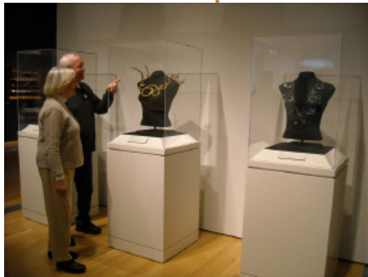
Calder Jewelry Exhibition

Charley stated: The Board of Trustees is grateful to help support such a committed group of volunteers and he feels that the health of the museum depends on volunteers—we couldn't function without them.