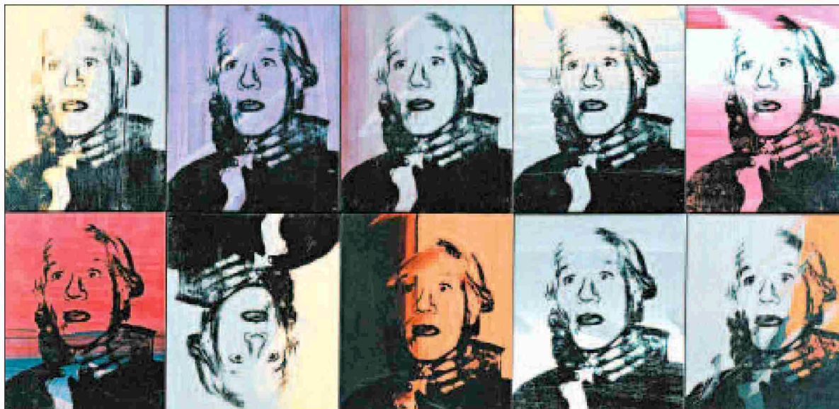
"Self-Portrait (Strangulation)" is one of nearly 50 Andy Warhol paintings in an exhibit at the Milwaukee Art Museum. Below, "The Thames" helps illustrate "Tissot's London" at the Grand Rapids Art Museum in Michigan.